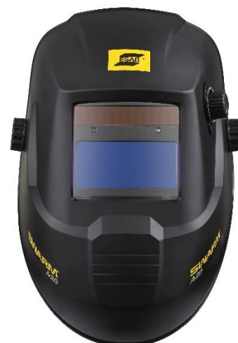
Lightweight, streamlined shell design with 1/1/1/2 CE optical clarity.