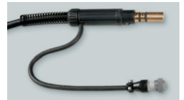
20-foot (6.1 m) direct-connect cable with heavy-duty strain relief.

Heavy-duty drive motor and cast aluminum gearbox.