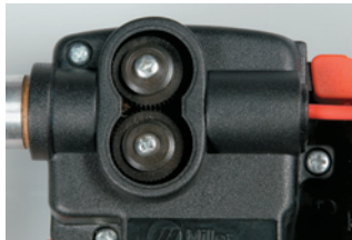
Dual V-knurl drive rolls for consistent feeding.