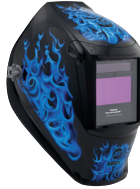
Blue Rage™ 289802