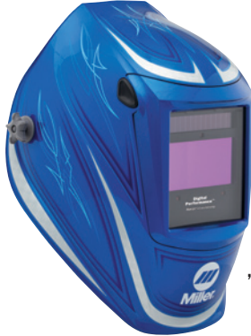
'64 Custom™ 289807