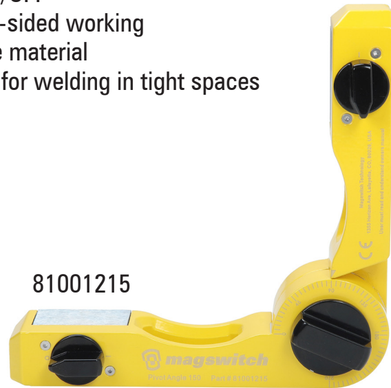
Pivot Angle 150 Mini