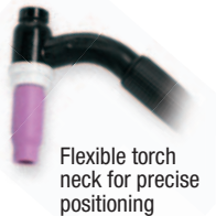
Flexible torch neck for precise positioning

150 amp ACHF or DCSP @ 100% Gas-Cooled Length: 8-3/4" (22.2cm) Weight: 5 oz. (141gm)