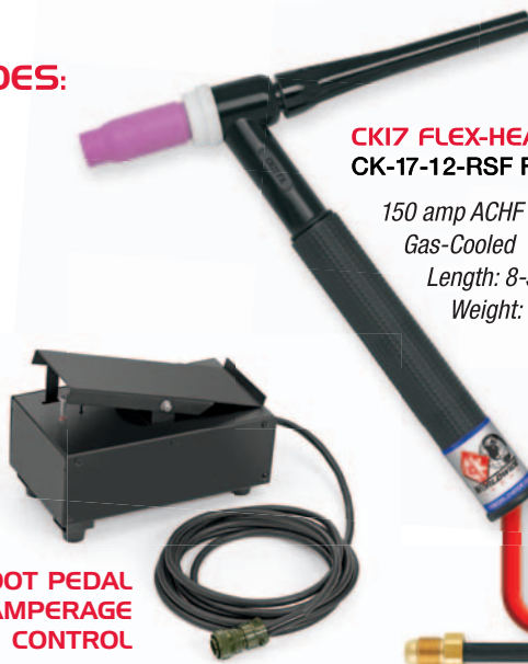
CK17 FLEX-HEAD TORCH CK-17-12-RSF FX

150 amp ACHF or DCSP @ 100% Gas-Cooled Length: 8-3/4" (22.2cm) Weight: 5 oz. (141gm)