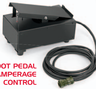
FOOT PEDAL AMPERAGE CONTROL