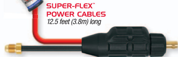
SUPER-FLEX™ POWER CABLES 12.5 feet (3.8m) long