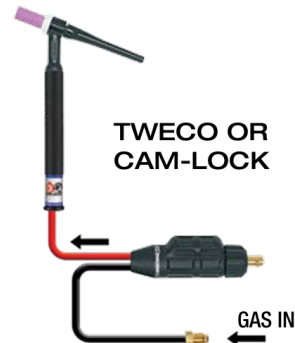
TWECO OR CAM-LOCK