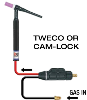
TWECO OR CAM-LOCK