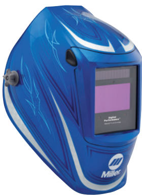
'64 Custom™ 296751