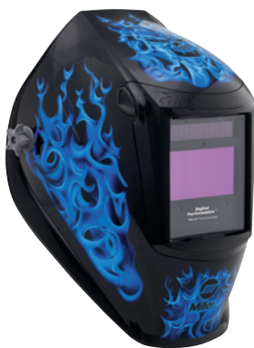
Blue Rage™ 296753