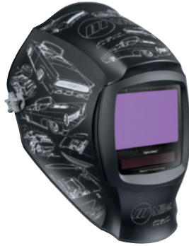
'22 Custom Kindig-it 292933