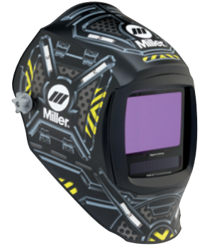
Black Ops™ 289715