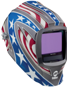
Stars and Stripes™ 288420