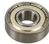
BALL BEARING (PRESSURE ROLL)