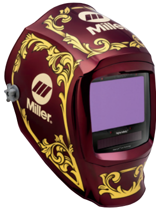
NEW! Imperial™ 280053