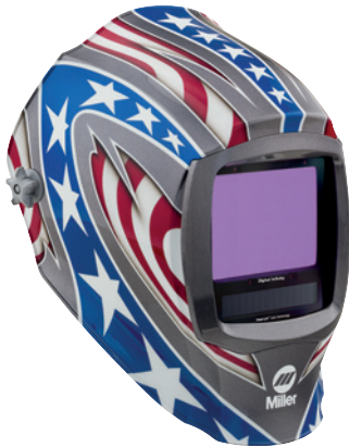
Stars and Stripes™ 280049

©2019 Caterpillar. CAT, CATERPILLAR, BUILT FOR IT and their design marks are registered trademarks of Caterpillar, Miller Electric Mfg. Co. is a licensee of Caterpillar Inc.