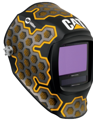
Cat® 2nd Edition 282007