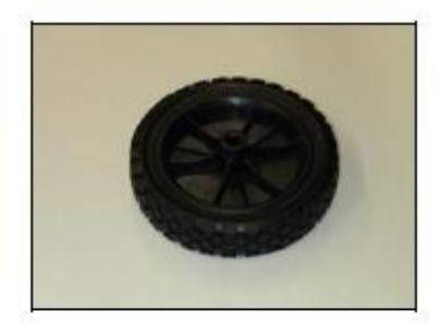
2 Pieces Wheel