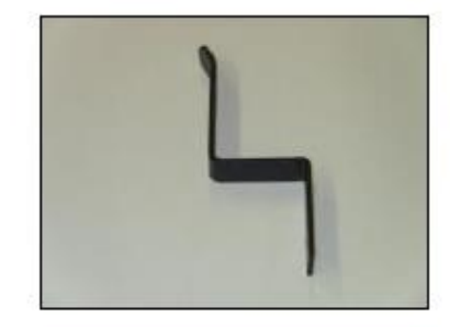
2 pieces Cable Holder