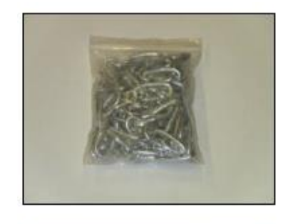
1 package Cylinder Chains

Please check the contents of your package. These contents are stored inside the cabinet drawers.