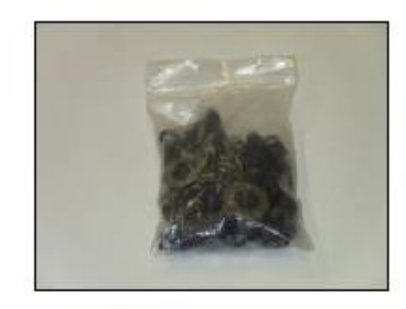
1 package Assembly Hardware