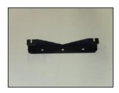
2 Pieces Gas Rack