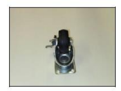
2 Pieces Casters