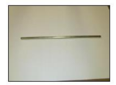
1 Piece Axle