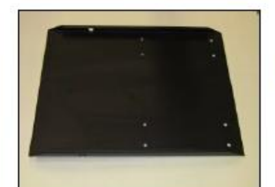
1 Piece Bottom