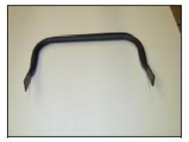
1 Piece Handle