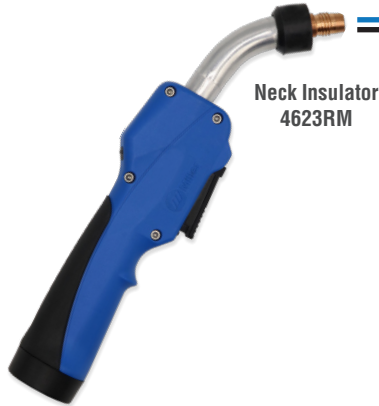
Neck Insulator 4623RM